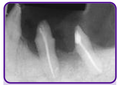
Figure L2 Radiograph five months later shows resorption of extrusion and healing of periapical lesion.