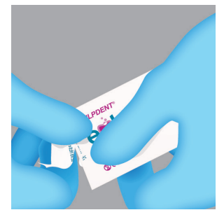
Pinch varnish foil pack to push contents back from tear line, and tear at slit to open varnish pack.