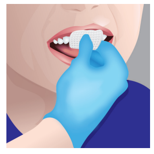
Dry the teeth with a gauze pad. It is best if the teeth are clean, but prophylaxis is not necessary.